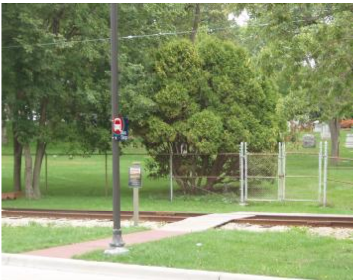
At our Lake Calhoun platform the walkway from the Metro Transit bus stop to our temporary platform was finished by the city's forces. Our ultimate plan is to construct a permanent platform here that will be approximately 55-feet long so the center and rear doors of our streetcars can be used.