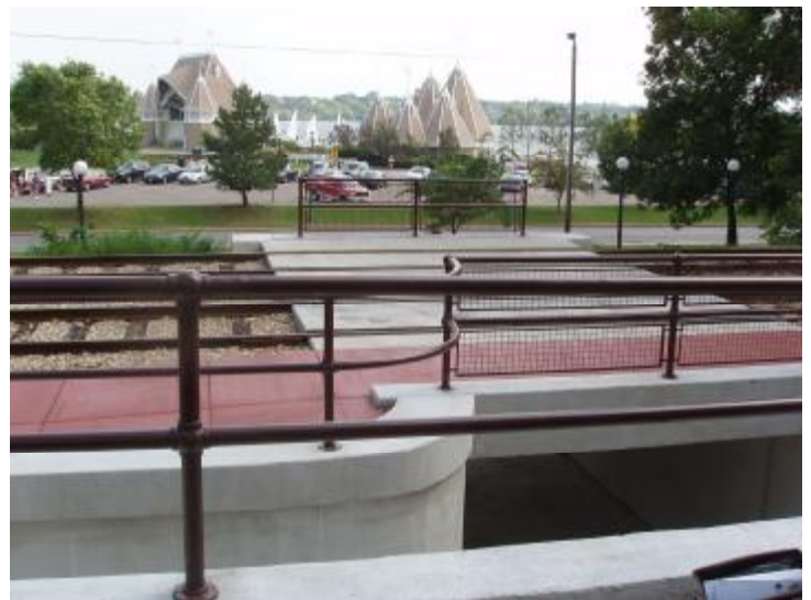
This photo shows the upper level safety screens mounted on the railings on each side of the pedestrian underpass. This is an instance when modern safety concerns trump historical accuracy.