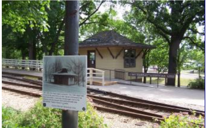
This photo shows one of the interpretive signs located approximately where the photographer was standing in 1905 when he took the photo of the original Linden Hills station shown on the sign.